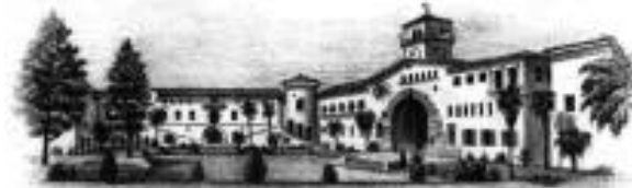
Santa Barbara County Department of Alcohol, Drug and Mental Health