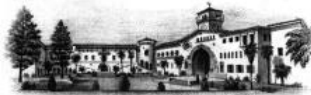
Santa Barbara County Department of Alcohol, Drug and Mental Health